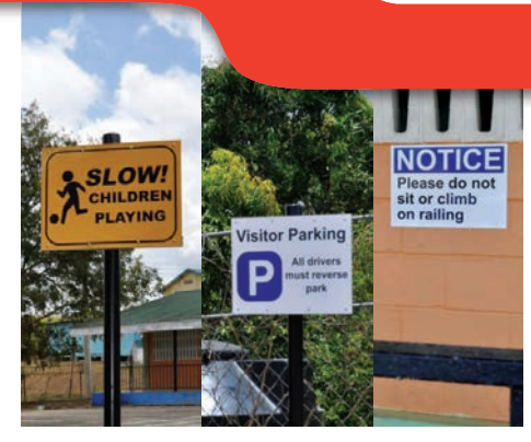
Safety signs at Milton Presbyterian Primary School

In April 2017, National Energy was pleased to instal the signage which will help raise HSSE awareness among all who attend and visit the school daily. Through this positive step and