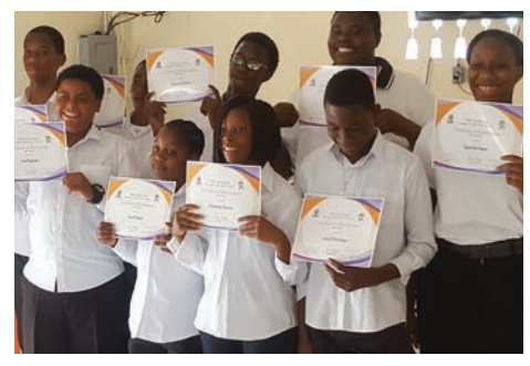
Students display their certificates at the graduation ceremony

Wealth Generation Funds were made available for the band to invest in entrepreneurial initiatives. These initiatives were approved based on suitable projected returns and entrepreneurial spirit, as well as long-term sustainability. On Saturday 15th April 2017, the band held a cake sale to raise funds. In the future, the band hopes to construct a computer room for IT classes.