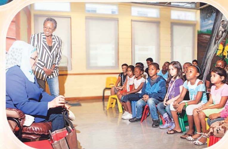
Storytelling with the children