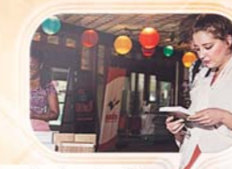
Browsing book stalls