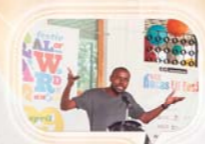
Open Mic at NGC Bocas Lit Fest