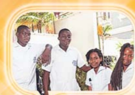
Students attend the NGC Bocas Lit Fest