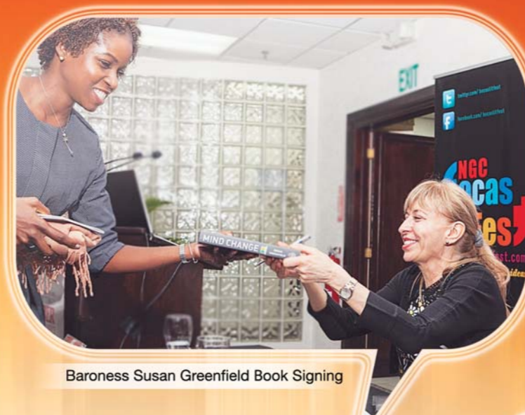
Baroness Susan Greenfield Book Signing