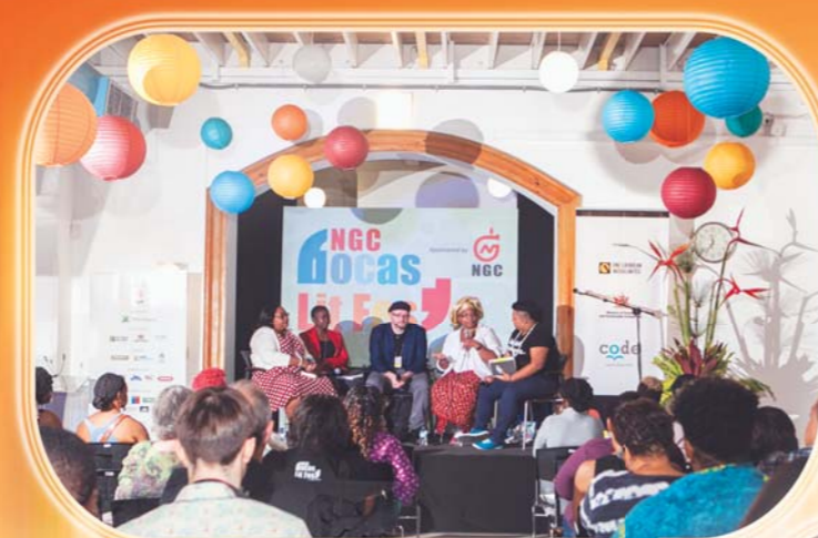
The Future Friday panel

NGC is honoured to be associated with this trailblazing Festival. The NGC Bocas Lit Fest showcases the brilliance of our region's literary vanguard and liberates the voices and creative energies of our budding writers and poets.