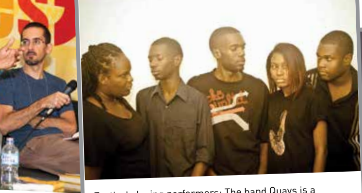
Festival closing performers: The band Quays is a unique blend of musicians, vocalists and poets.