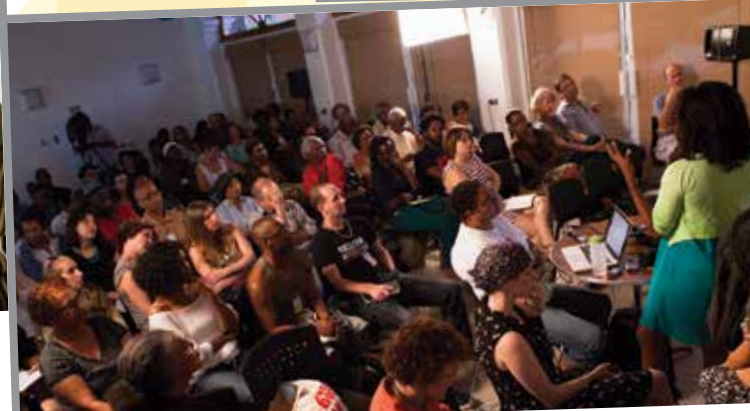
Engaging discussion was common fare at the workshops.