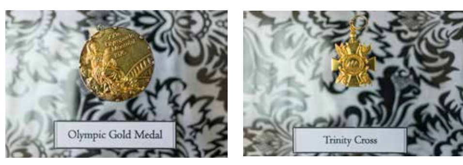
Hasely Crawford's Olympic Gold Medal and Trinity Cross

The physical exhibit will find a permanent home at the Hasely Crawford Stadium and plans are being finalised with The UWI for it to form part of the University's virtual museum. Heroes are found in every field of endeavour, and it is foreseen that the curation and exhibition achievements of the other icons will be approached in a manner that best represents that person's life.