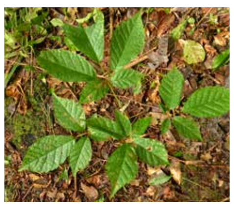
Young Cyphe tree