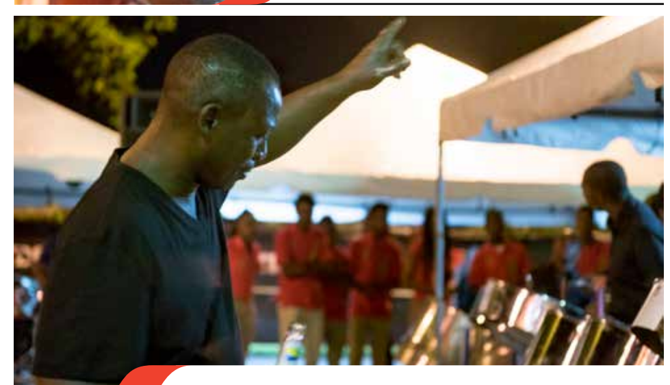
NGC Couva Joylanders Steel Orchestra - a patron enjoying the music