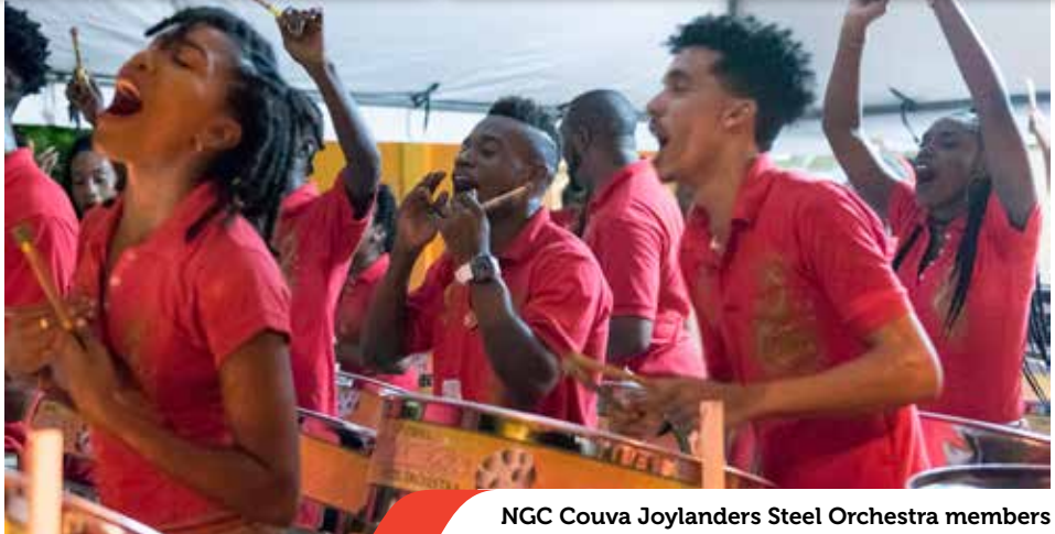
NGC Couva Joylanders Steel Orchestra members perform at "Titans of Steel" concert

In addition to its business of music and entertainment, the NGC Couva Joylanders is involved and devoted to the training and development of individuals within the Couva community and forming synergies with groups that