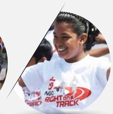
RIGHT ON TRACK