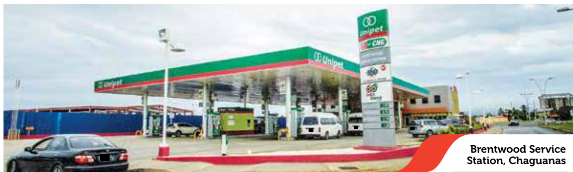
Brentwood Service Station, Chaguanas

After using CNG, here are what some happy consumers had to say: