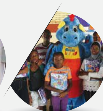
BOCAS LIT FEST