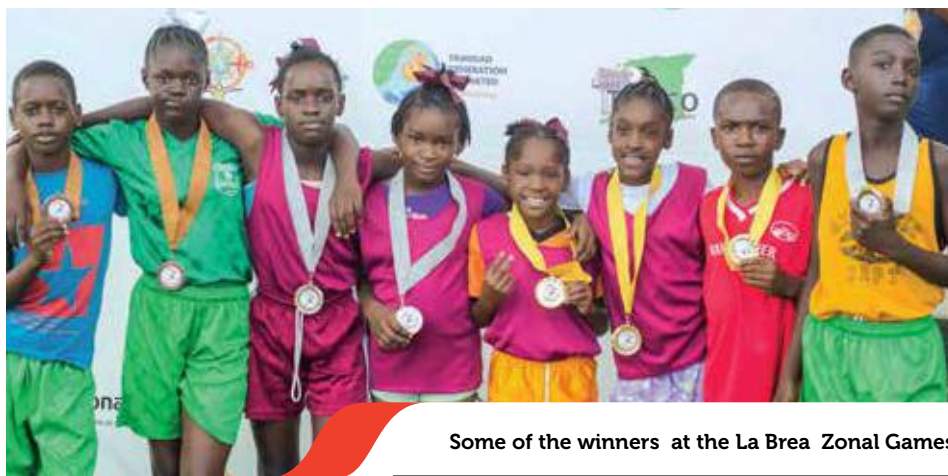
Some of the winners at the La Brea Zonal Games