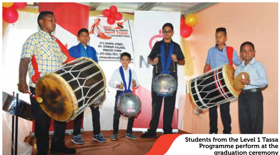
Students from the Level 1 Tassa Programme perform at the graduation ceremony

As the first institution of its kind in the country, its mission is to tutor persons interested in learning tassa drumming. The programme involves two-hour classes every week. Students are exposed to the musical genres of calypso, nagara, dingolay and chutney, as well as a history of the tassa art form.