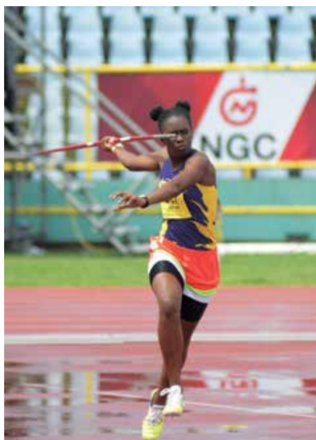
NGC/NAAA Open Champs 24 June 2018

Competing with the rain and World Cup, the NGC/NAAATT Championship Month cemented its claim as the main track and field event on the national track and field calendar.