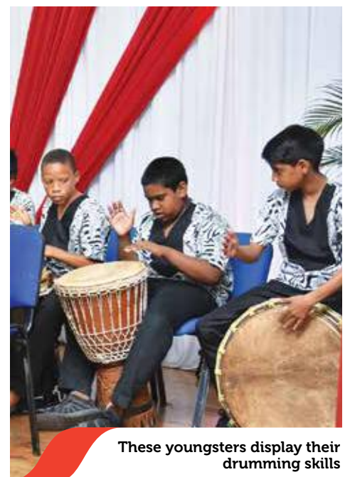
These youngsters display their drumming skills