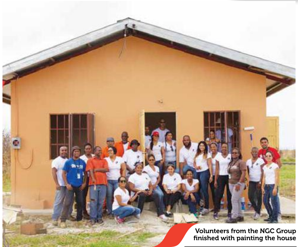
Volunteers from the NGC Group finished with painting the house

construction of five new homes per year for families in need. This effort is often supported by employees, who are eager to donate their time, skill, knowledge and energy to the programme. The partnership with HFHTT is a tangible and visible part of NGC's Corporate Social Responsibility programme.