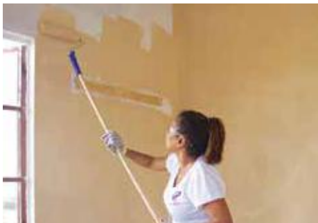
A volunteer from the NGC Group

For several years, NGC has partnered with the international organisation HFHTT, offering both financial and practical support. Over the last three-year period of sponsorship, NGC has assisted with the