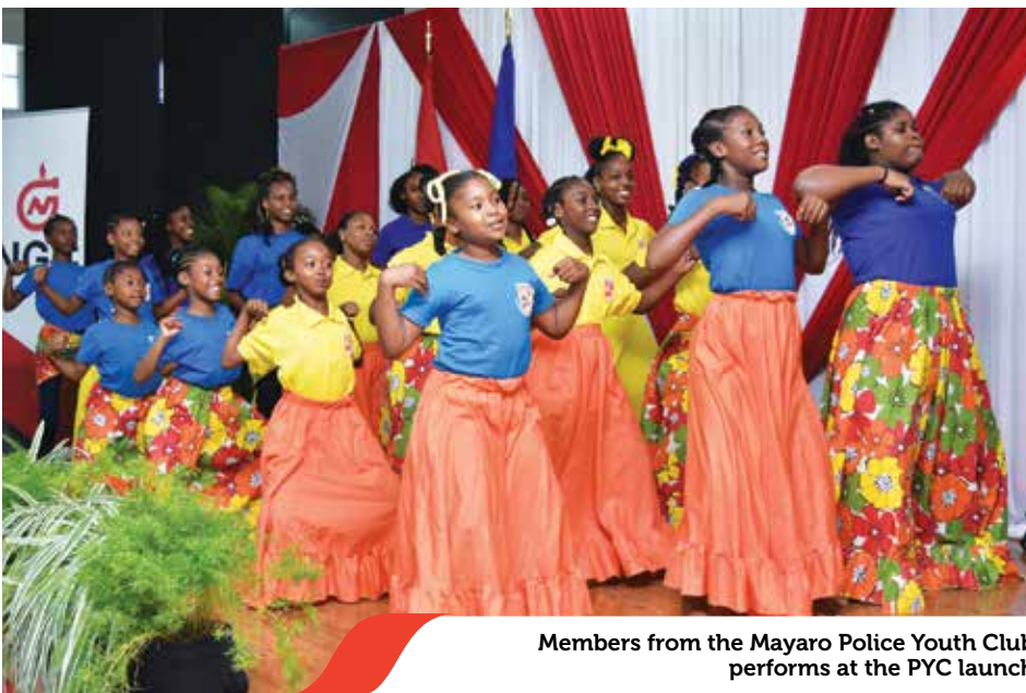
Members from the Mayaro Police Youth Club performs at the PYC launch

Get your kids involved at the one nearest you.