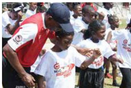
This young participant gets training on proper technique from the coach