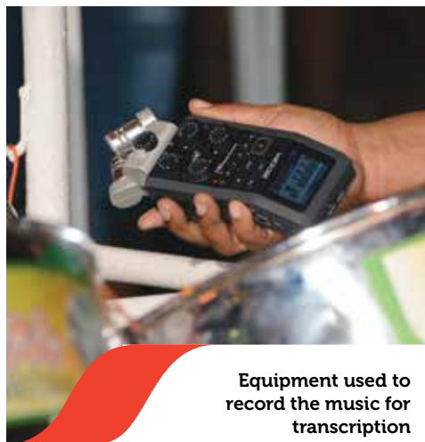
Equipment used to record the music for transcription

The Carnival season has come and gone and so has the live music from the steel bands. NGC did not want the music to be lost and embarked on a mission to capture the steelpan music of its sponsored bands on paper, so it can be read and played anytime. To achieve this, NGC partnered with The University of the West Indies (The UWI) Department of Creative and Festival Arts to carry out a music scoring programme.