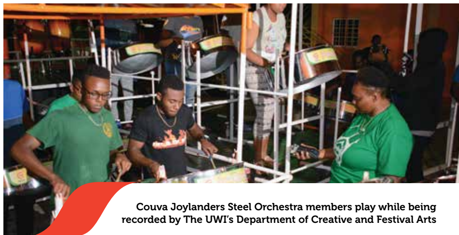
Couva Joylanders Steel Orchestra members play while being recorded by The UWI's Department of Creative and Festival Arts