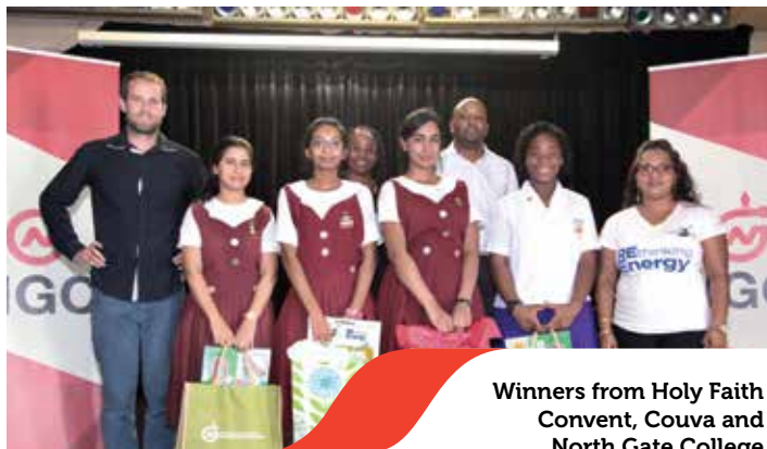
Winners from Holy Faith Convent, Couva and North Gate College