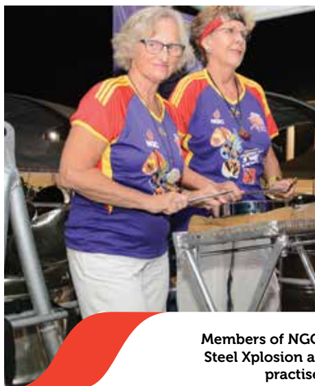
Members of NGC Steel Xplosion at practise