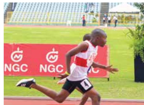
Athletes at NGC/NAAATT Juvenile Championships

We will give you a full rundown of the Championship Series in our next issue.