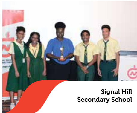
Signal Hill Secondary School