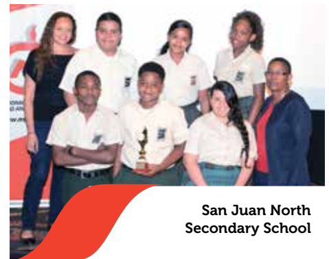
San Juan North Secondary School