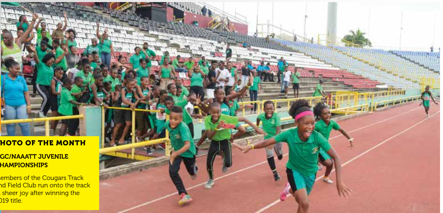
PHOTO OF THE MONTH

Answers: 1. True 2. False 3. False 4. False 5. True 6. True 7. False 8. True 9. False 10. True