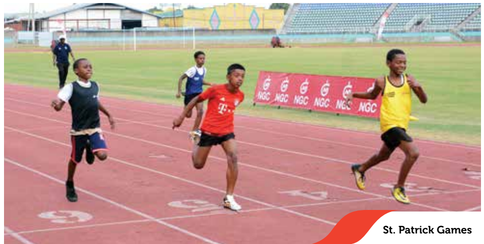
St. Patrick Games