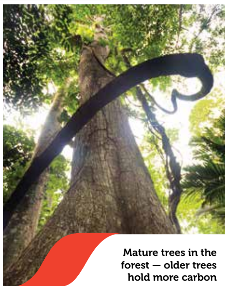
Mature trees in the forest — older trees hold more carbon