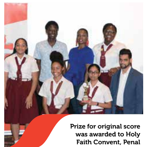
Prize for original score was awarded to Holy Faith Convent, Penal