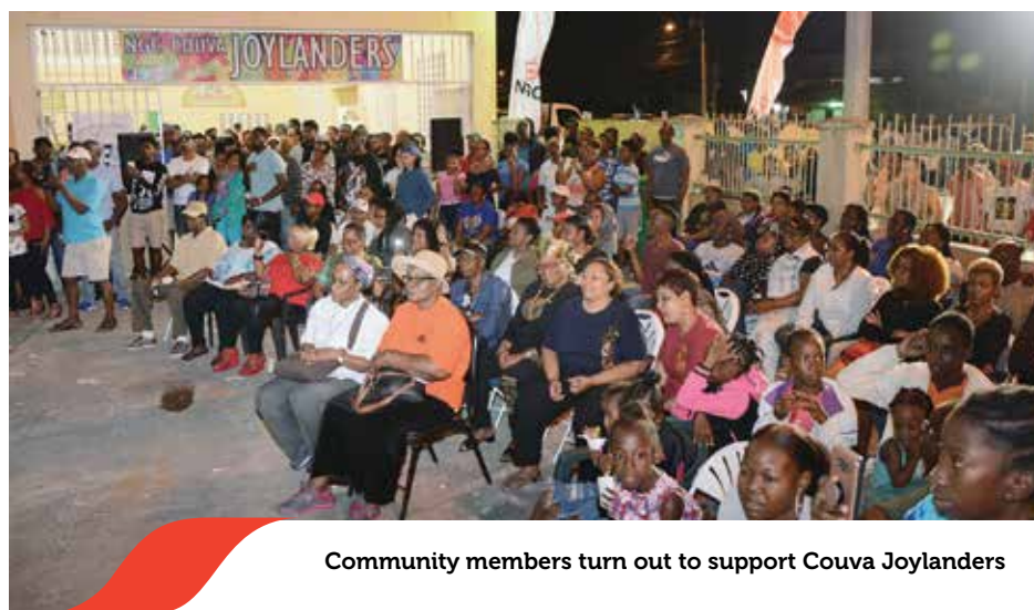
Community members turn out to support Couva Joylanders