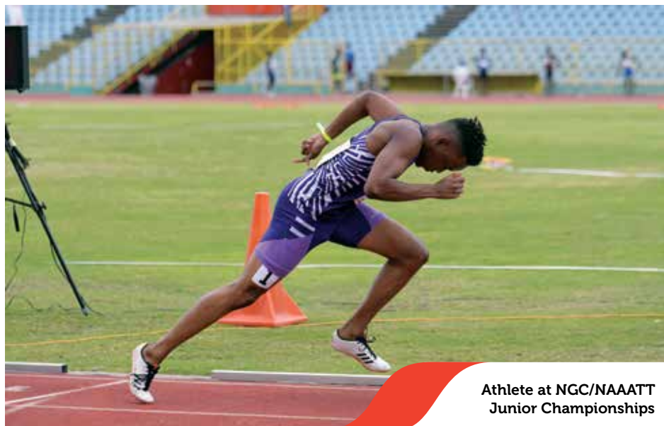
Athlete at NGC/NAAATT Junior Championships