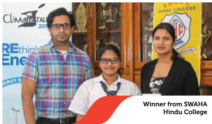
Winner from SWAHA Hindu College

Delving into the realms of energy efficiency and renewable energy, is part of NGC's commitment to becoming a sustainability leader in Trinidad and Tobago. To begin its journey, NGC noted that education was key to influencing behavioural change.