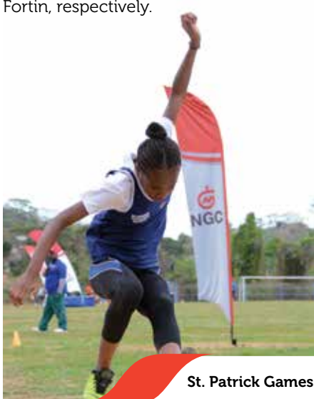
St. Patrick Games