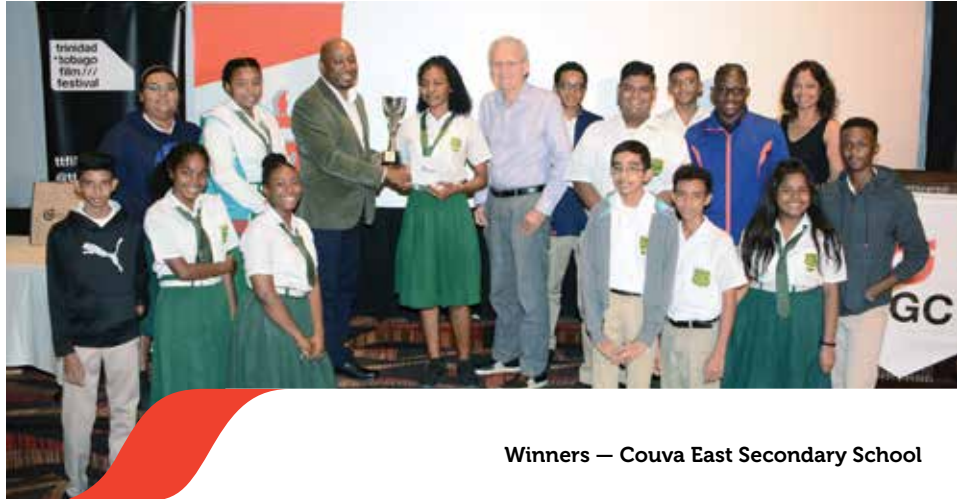
Winners — Couva East Secondary School

Congratulations to the winners and all schools for participating in the competition.