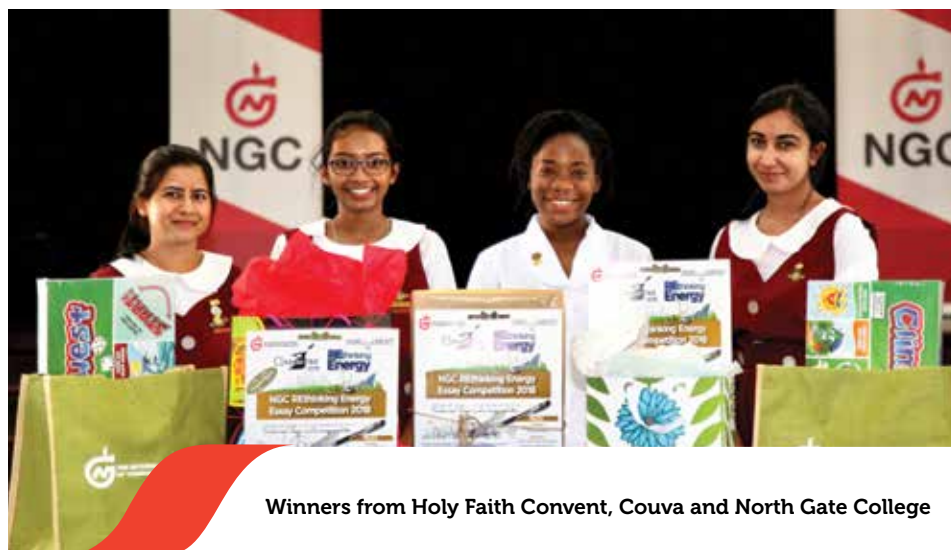
Winners from Holy Faith Convent, Couva and North Gate College

Secondary school students were invited to participate in the Rethinking Energy