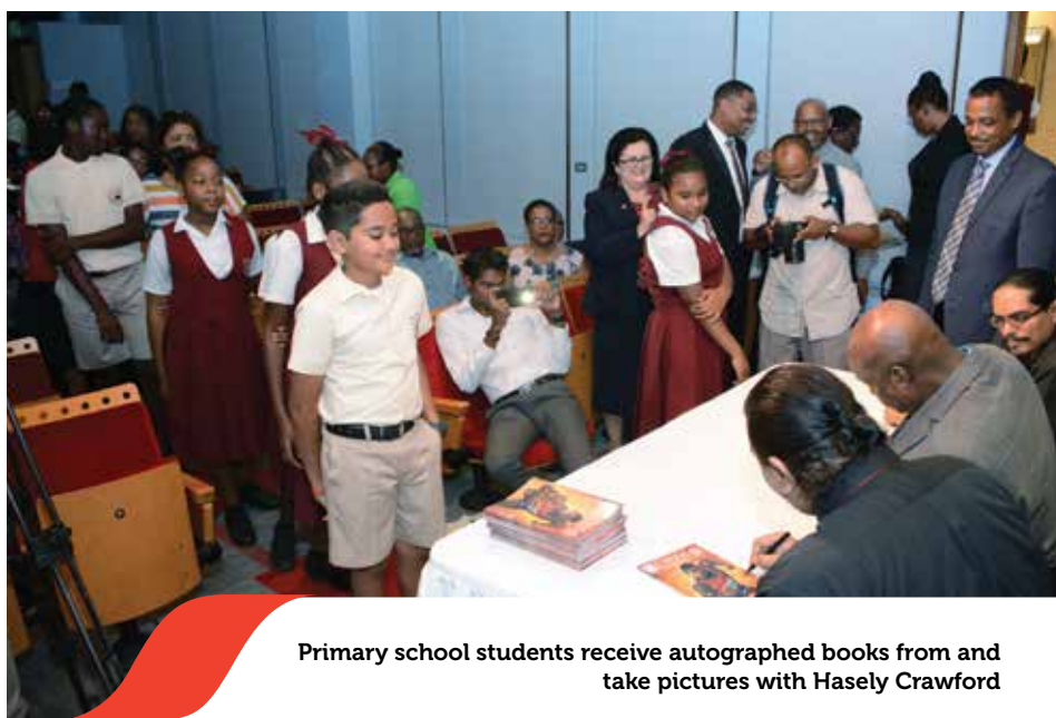
Primary school students receive autographed books from and take pictures with Hasely Crawford

Along with the launch of the comic book, the Hasely Crawford exhibition, a central