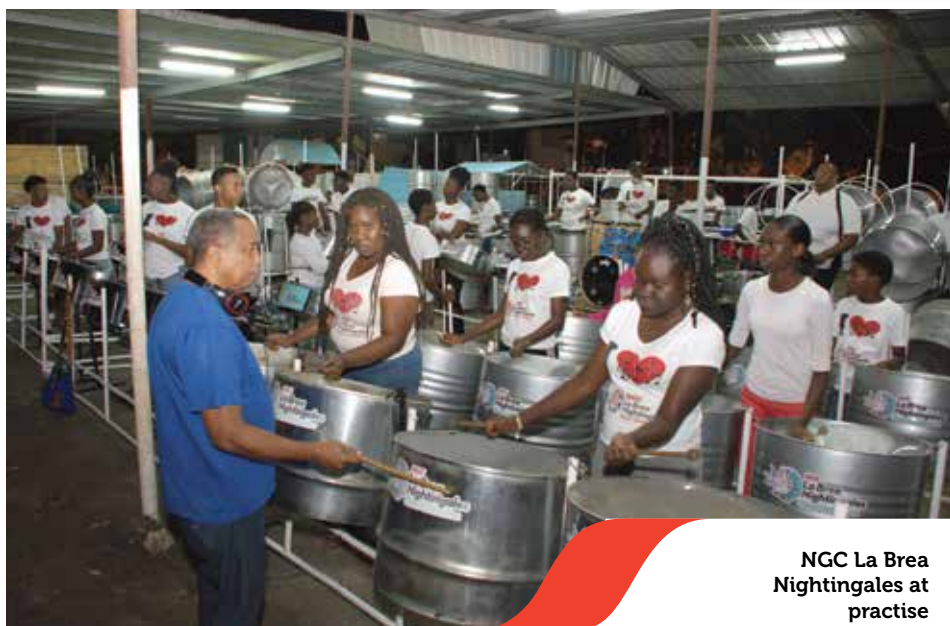
NGC La Brea Nightingales at practise

Instagram: https://www.instagram.com/ngc_tt/