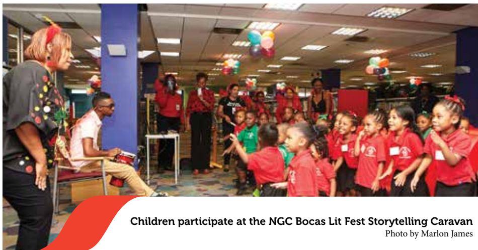
Children participate at the NGC Bocas Lit Fest Storytelling Caravan