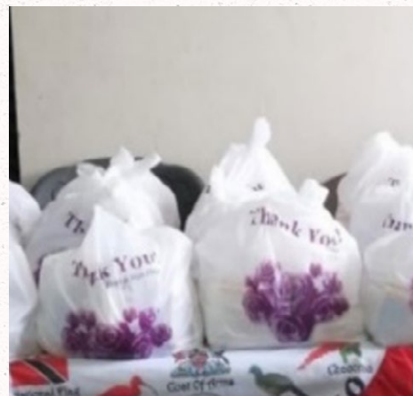
Hampers donated by LABIDCO for the food hamper drive

LABIDCO responded to a request from the Guapo Police Community Council