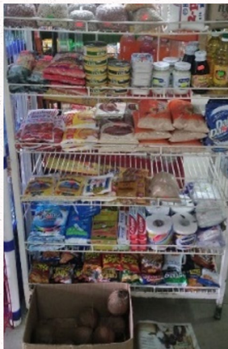
Community Shelf located at Aaron's Grocery & Variety Store.

La Brea Industrial Development Company Limited (LABIDCO) , a subsidiary of NGC, also contributed to mitigating the pandemic's consequences by sponsoring projects targeted at