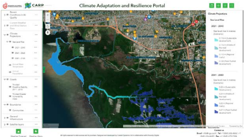
Figure 3: 2061-2100