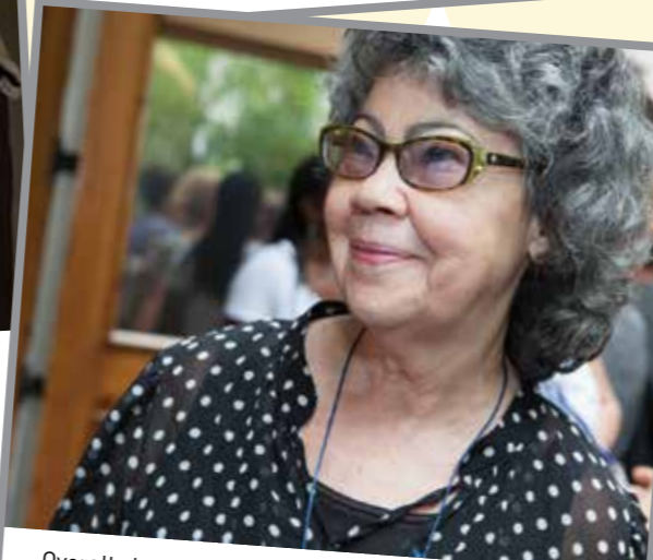
Overall chair of the awards committee and Jamaican author, Olive Senior.