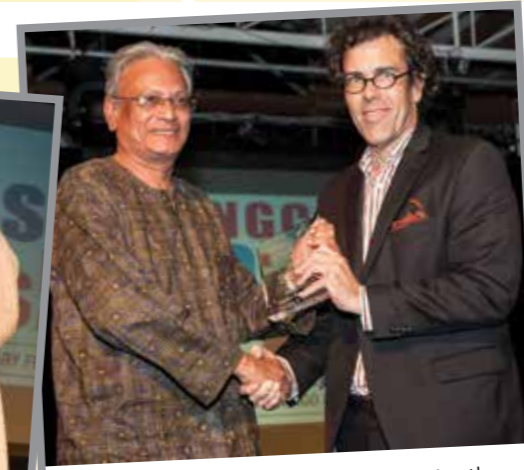
Guyanese author Rupert Roopnaraine wins the Non-Fiction OCM Bocas Prize for The Sky's Wild Noise: Selected Essays .