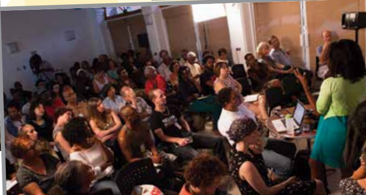
Engaging discussion was common fare at the workshops.