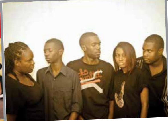
Festival closing performers: The band Quays is a unique blend of musicians, vocalists and poets.