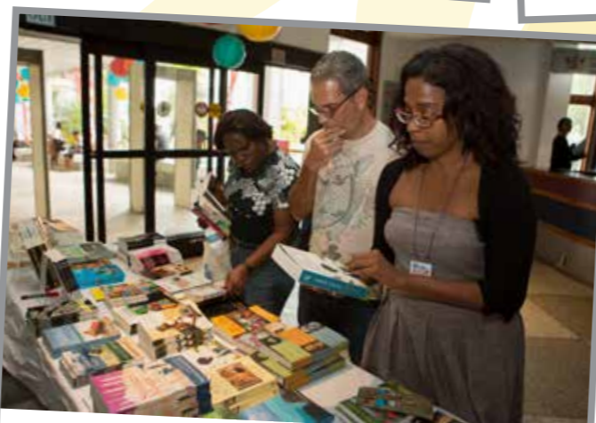
Patrons peruse the wide array of books on sale at the National Library during the festival.