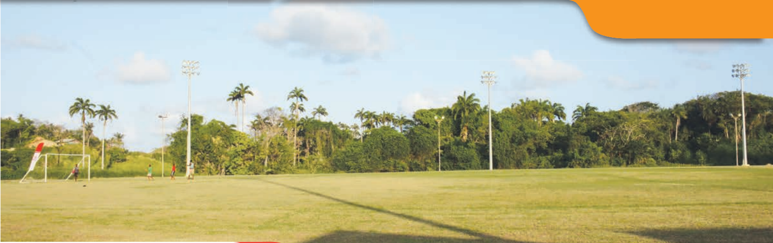
La Savanne Recreation Ground – lighting system