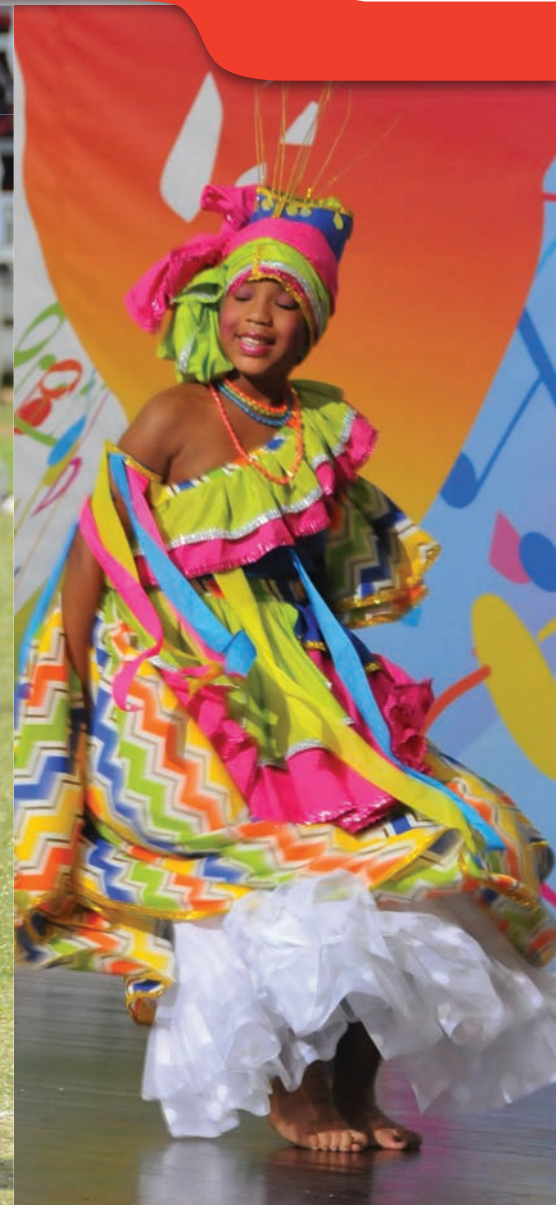
Performance at Sanfest 2016