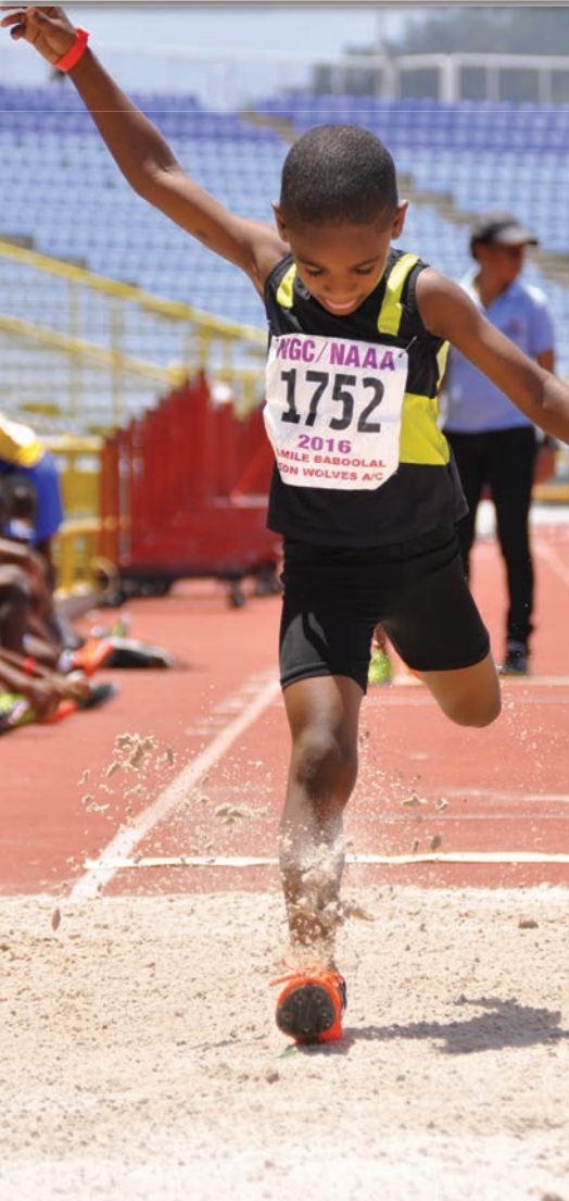
Child participating in NAAA 2016