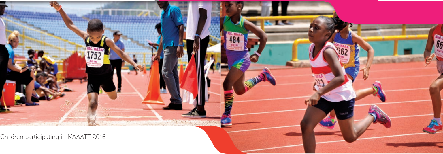
Children participating in NAAATT 2016