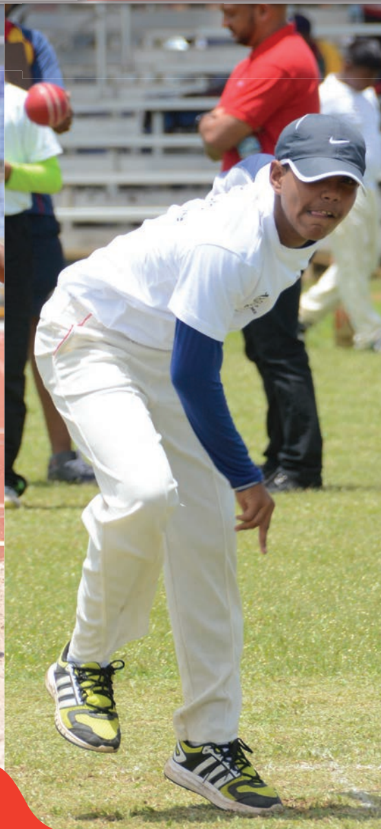
TTCB Grassroots Development Programme Fun Day 2016