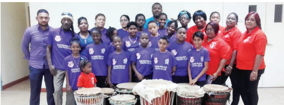
Couva Police Youth Club Drumology Class – students, tutor, parents and NGC's Community Relations Officer, at left

The drumology class of the NGC-sponsored Couva Police Youth Club (PYC) participated in the Prime Minister's Best Village Trophy Competition in 2016. It was held at the Queen's Park Savannah on 8th September, 2016. The PYC competed against 163 other drumology groups and despite being the youngest group performing for the first time, they placed in the top 10 nationwide. The competition seeks to encourage a sense of national pride, community spirit and community upliftment through healthy competition and social interactions.