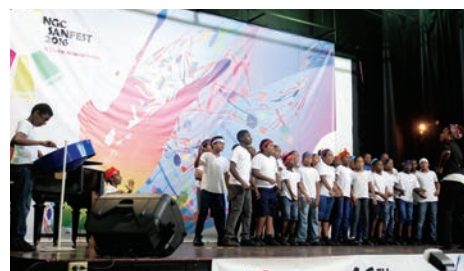
Students from various schools participating in NGC Sanfest 2016