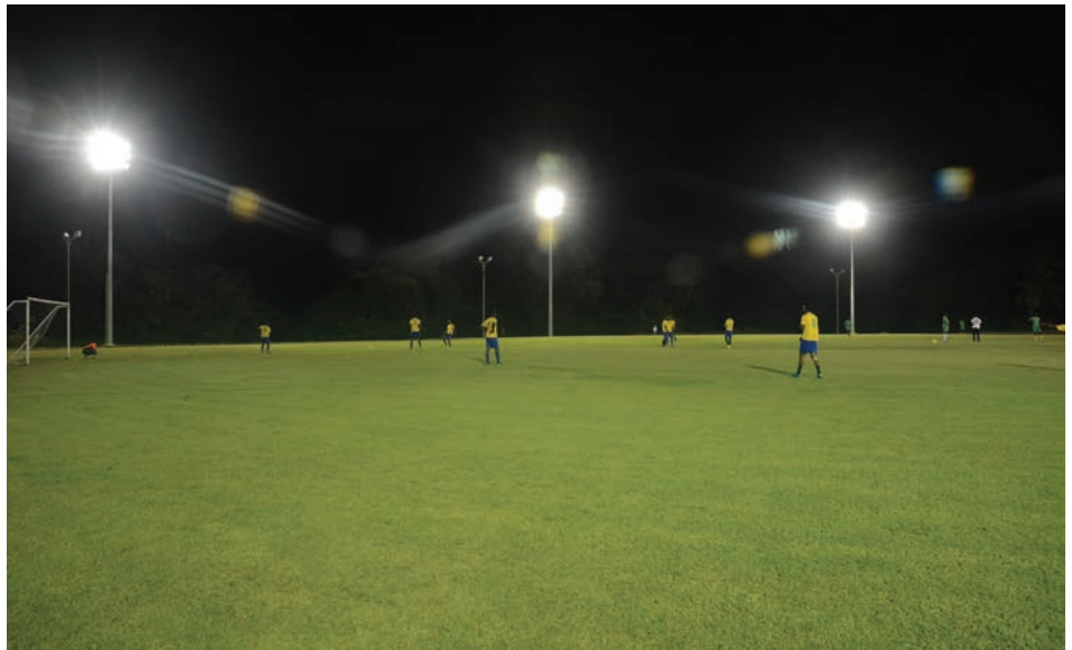
Football game at night – La Savanne Recreation Ground

Before the upgrade of the lighting system, the activities offered at the recreation ground via community groups were limited to the day time/evenings, after school or work. Since the lighting upgrade, the recreation ground is in use every day of the week and activities end