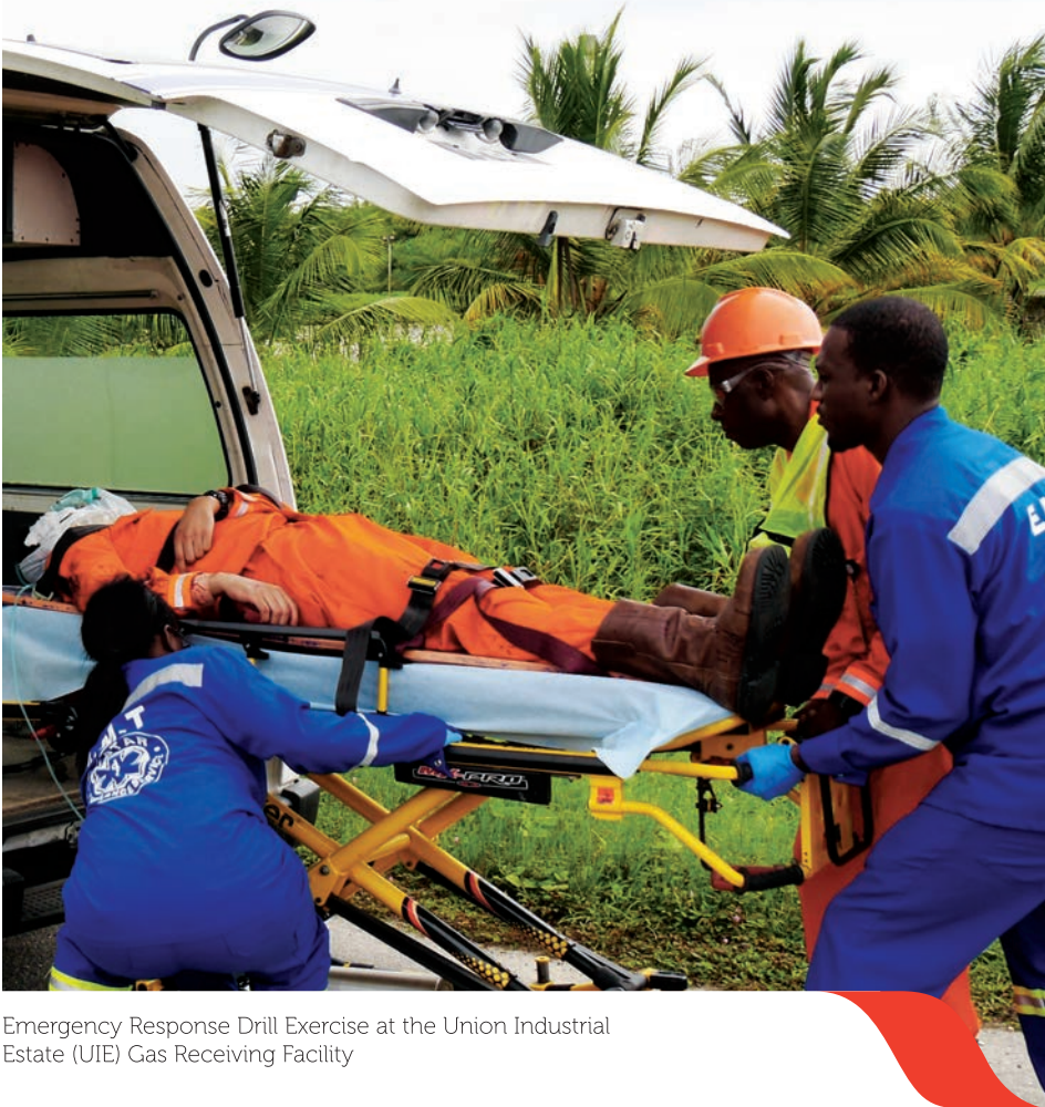
Emergency Response Drill Exercise at the Union Industrial Estate (UIE) Gas Receiving Facility