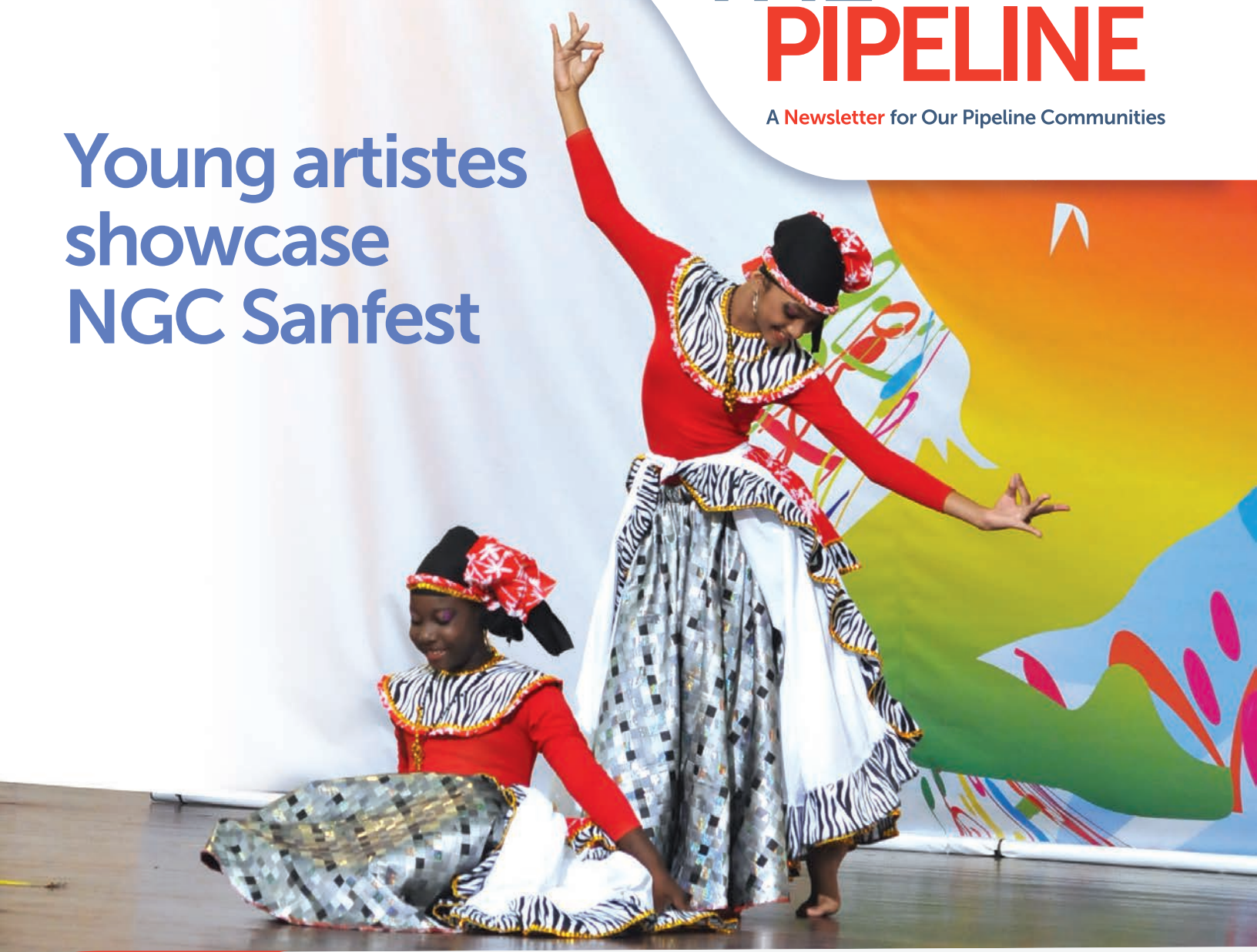
Children participating at The National Junior Arts Festival (NGC SANFEST) 2016