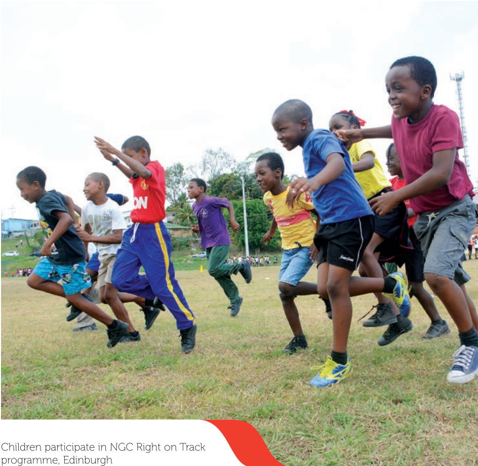
Children participate in NGC Right on Track programme, Edinburgh