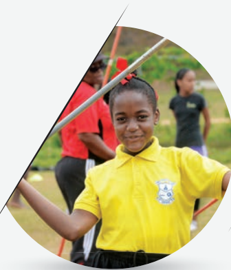
NGC RIGHT ON TRACK